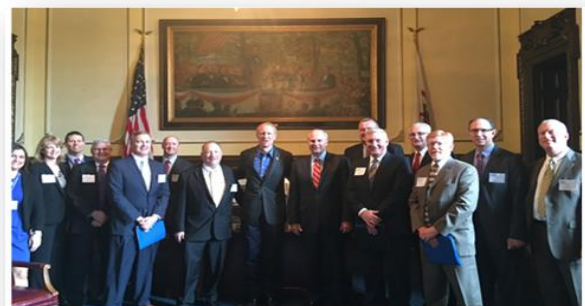
CBAI Leadership meets with Governor Bruce Rauner

The 100-plus community banker delegation then departed for the Capitol to reinforce existing relationships and create new ones by engaging in the hands-on lobbying of their legislators. CBAI leadership met with Governor Bruce Rauner, and