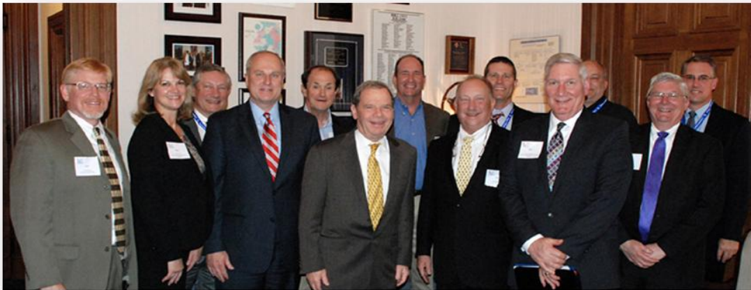
CBAI Bankers meet with Senate President John Cullerton

The eventful day concluded with a reception at the Pinnacle Club, on the 30 th floor of the Wyndham Springfield City Centre. This popular event allowed attendees to engage with legislators, IDFPR regulators, constitutional officers and their peers in a relaxed atmosphere with food, drink and a view of the Capitol.